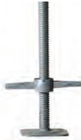
SOLID STEEL SCREW JACK